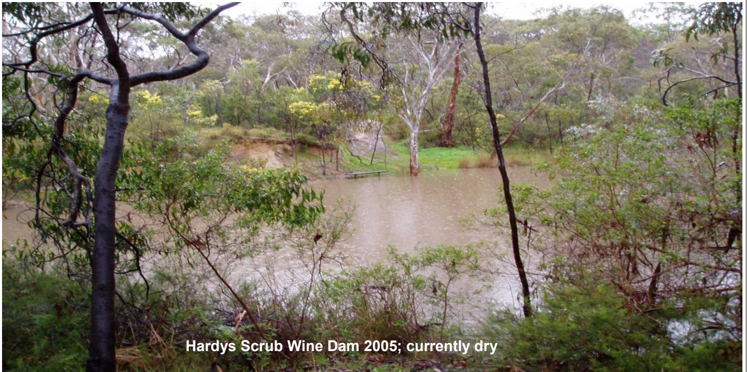
Hardys Scrub Wine Dam 2005; currently dry